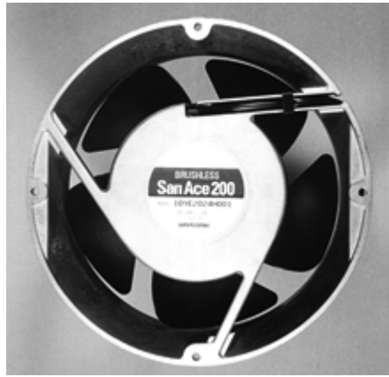
Fig.1 Outside view of "SAN ace 200"